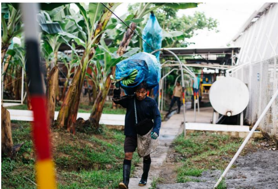
Banana worker in Costa Rica